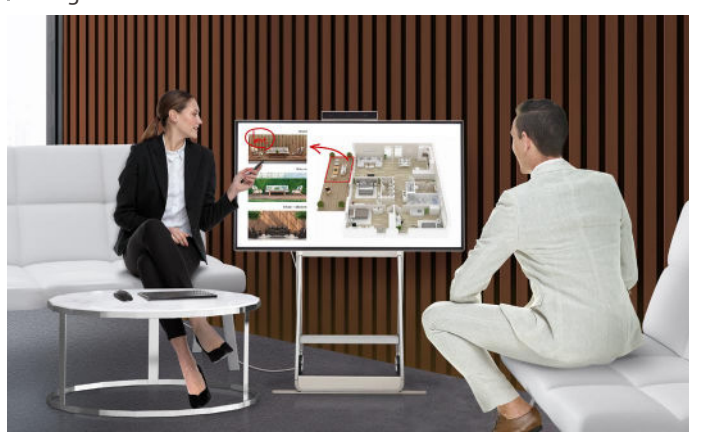
Have meetings and demonstrations with clients and contract in one place.