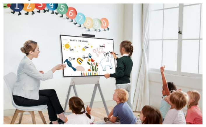
An interactive educational tool for the child, with which their drawings and writings from during class can be saved as image files.