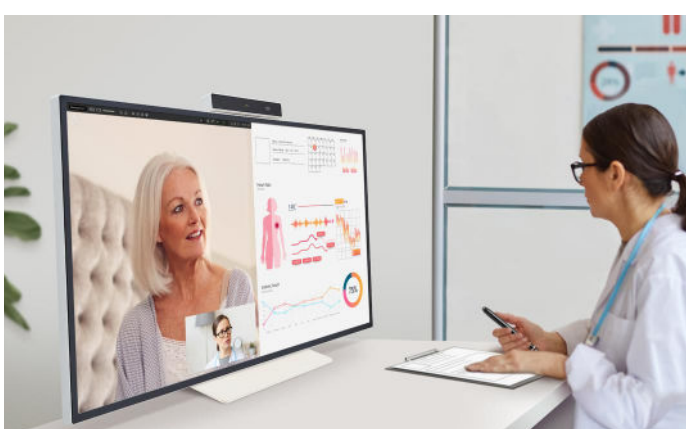
Perform simple consultations or medical examinations remotely without meeting with the patient.