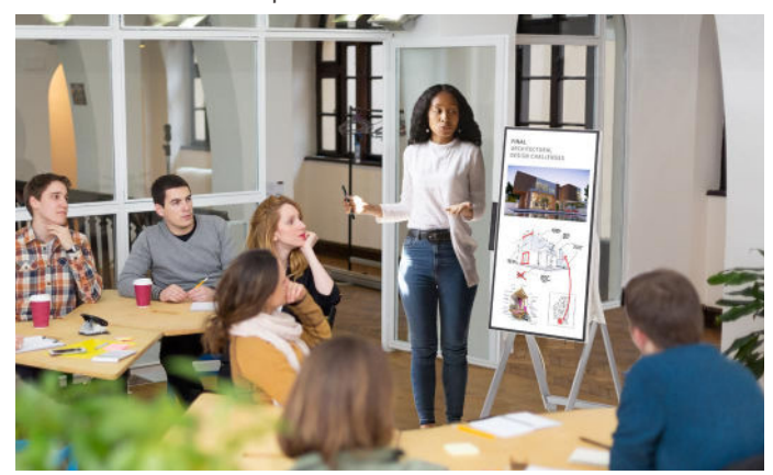
Employees can freely describe their creative ideas with drawing and writing.