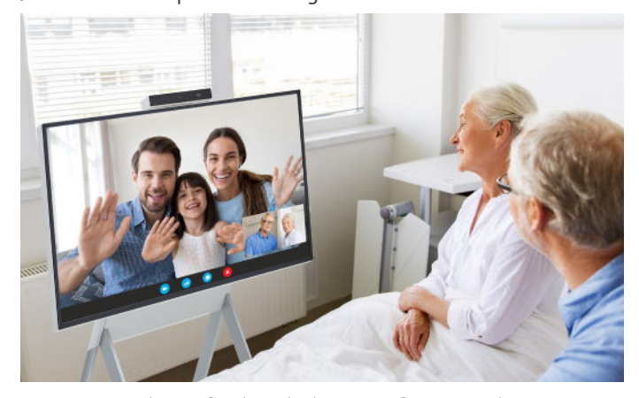
Re-connect with your family and relatives as if you were there.