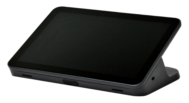
Mimo Myst Link